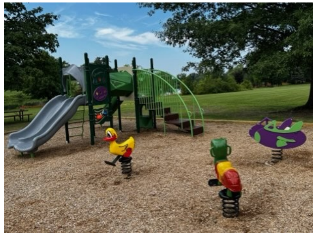
Larger Playground (New 2025)