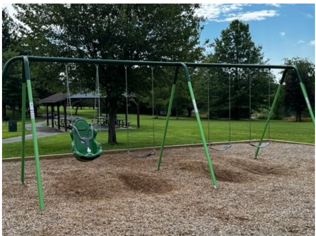
Larger Playground (New 2025)