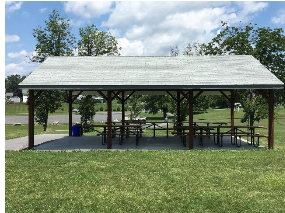
Open Air Pavilion

The other pavilion within the Township Community Park is located along the walking path between the sports fields. There are six picnic tables which can easily accommodate 48 people. This is simply an open-air pavilion with no electric or running water.