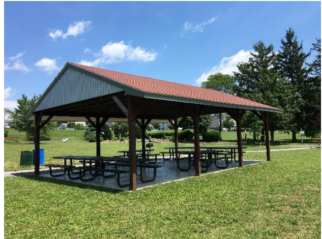
Open Air Pavilion # 2