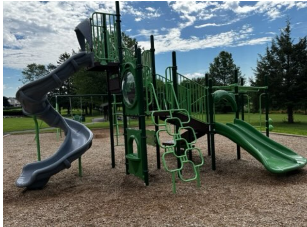
Larger Playground (New 2025)