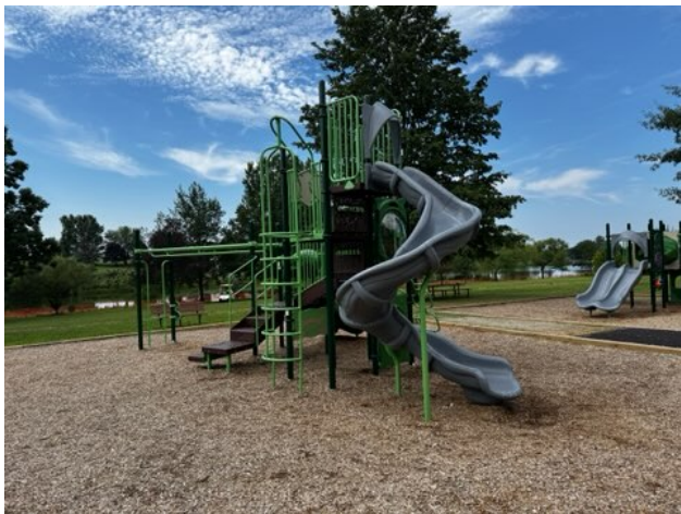
Larger Playground (New 2025)