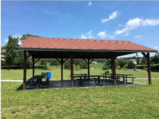
Open Air Pavilion # 2