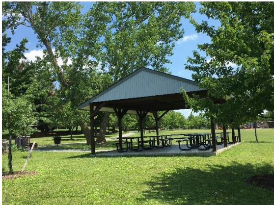
Open Air Pavilion # 1

The other two pavilions within Lions Lake Park are located along the walking path accessible from the Water Street Parking entrance. There are six picnic tables within each pavilion which can easily accommodate 48 people each. They are both simply open-air pavilions with no electric or running water. The first one is located just off the Water Street entrance while the second one is adjacent to the larger playground area.