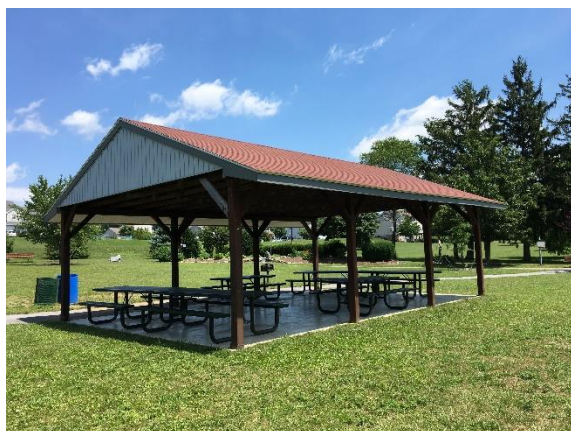
Open Air Pavilion # 2