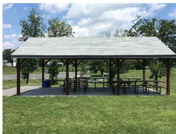
Open Air Pavilion

The other pavilion within the Township Community Park is located along the walking path between the sports fields. There are six picnic tables which can easily accommodate 48 people. This is simply an open-air pavilion with no electric or running water.