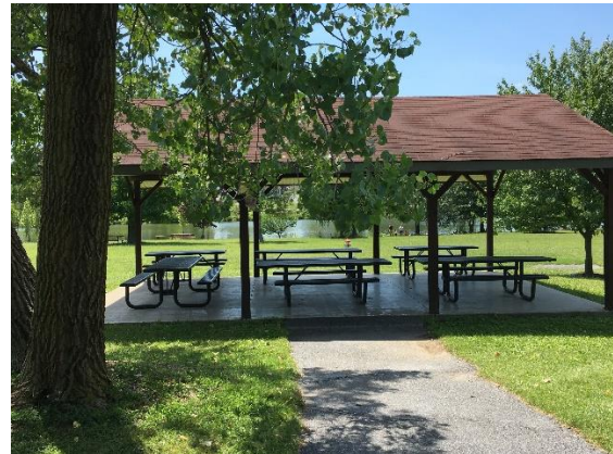
Open Air Pavilion # 1