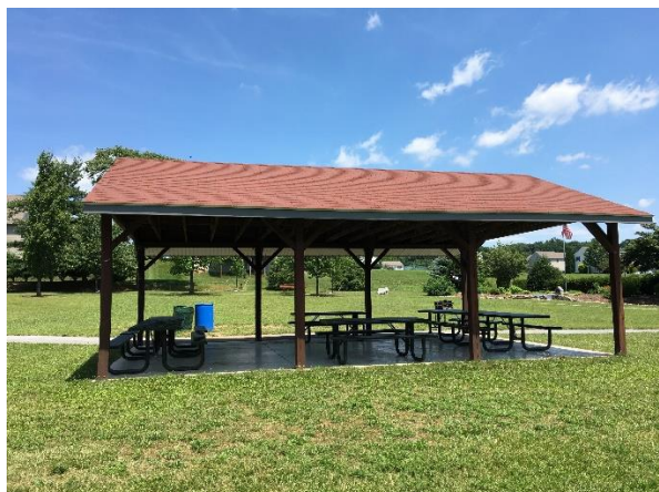
Open Air Pavilion # 2