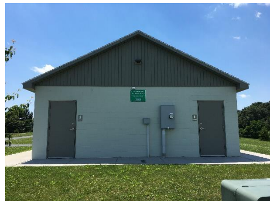
Restrooms attached to open air pavilion #1