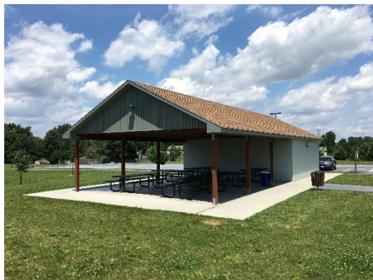
Open air pavilion #1 (option of electric)

Lenni Lenape Park is our newest park, which is located at 723 Narrows Drive, just north of Weavertown Road. This park offers two open-air pavilions with six picnic tables which can easily accommodate 48 people. The open-air pavilion #1 has electricity available, if desired. Please indicate whether you wish to use the electric so our park foreman can turn on the electric. The restrooms are located on the other half of pavilion #1. This pavilion is handicap accessible and the views are beautiful from this park. It also has two playgrounds (one for younger children and one for older children), a walking path and a disc golf course. There are plenty of grassy areas for outdoor activities.