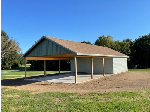
Open air pavilion #2